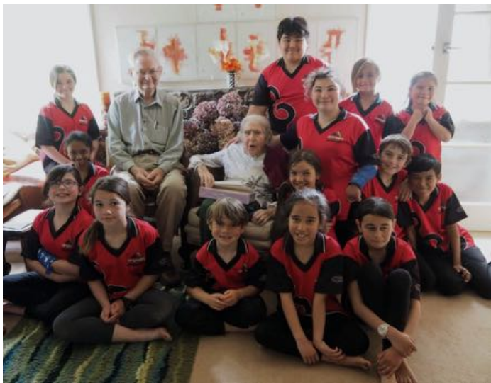
Our Hanana Junior Touch team, after a close final, WON their grade in Week 8, winning 5-4 after trailing at half time. We are so proud of your effort!

Grey Street Shannon Ph: 06 3627866 Text your absences: 027 7555591 Email: office@shannon.school.nz Website: www.shannon.school.nz Facebook: Shannon School Te Kura o Hanana